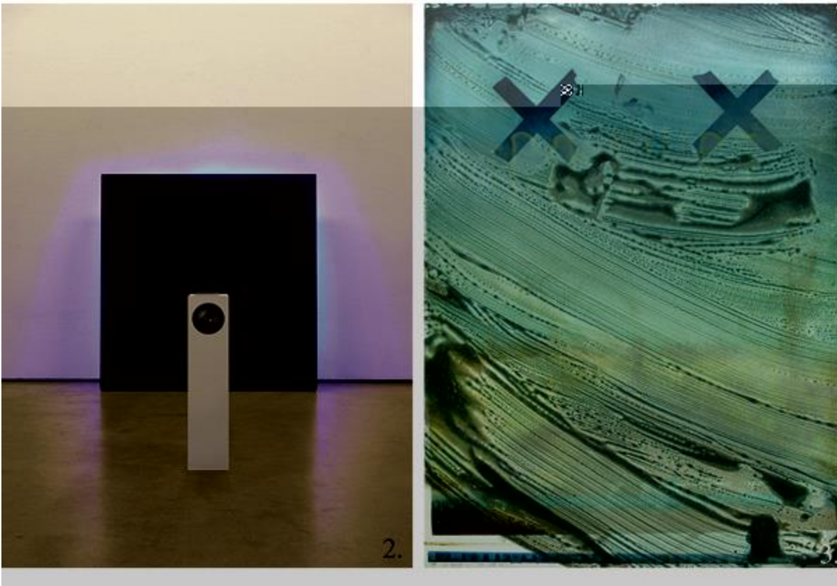
1. "Forming the Sound of Color"; 2016; mixed media